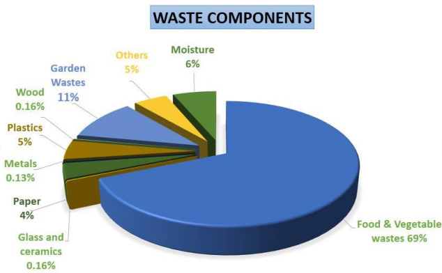
Fig.1: Composition of Municipal Wastes in Bangladesh

As is seen from the pie chart, there is very high percentage of food, vegetable and garden waste in Bangladesh. All of which is bio-degradable and hence municipal waste in Bangladesh will be a potential source for Bio gas production.